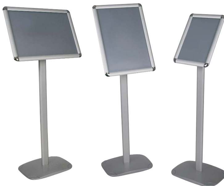
Sentry A3 (landscape)

Loosen wing nut and rotate frame to convert between landscape and portrait format.