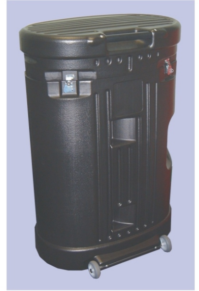
Rear of case

Oval insert (supplied with the case) can be secured to the case lid using hook fastener