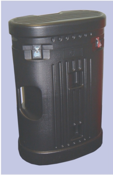
Front of case