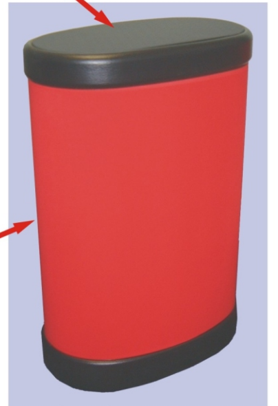
Fabric case to counter conversion

Optional case conversion wrap secured using hook fastener