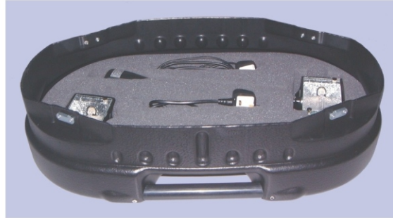
Foam lighting insert inside the case lid (Lighting not included)